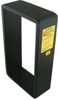
S 6x1 Ex Primed EXS006000000112

Cadres S Ex, acier doux peint ▶ S Ex Rahmen, Baustahl geprimert ▶ Marcos S Ex en acero dulce imprimado ▶ Telaio S Ex, in acciaio con prima mano d'antiruggine