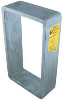
S 6x1 Ex AISI 316 EXS006000000121

Cadre S Ex acier inox résistant aux acides » S Ex Rahmen, säurefester, rostfreier Edelstahl » Marcos S Ex en acero inoxidable a prueba de ácidos » Telaio S Ex, in acciaio inox resistente agli acidi